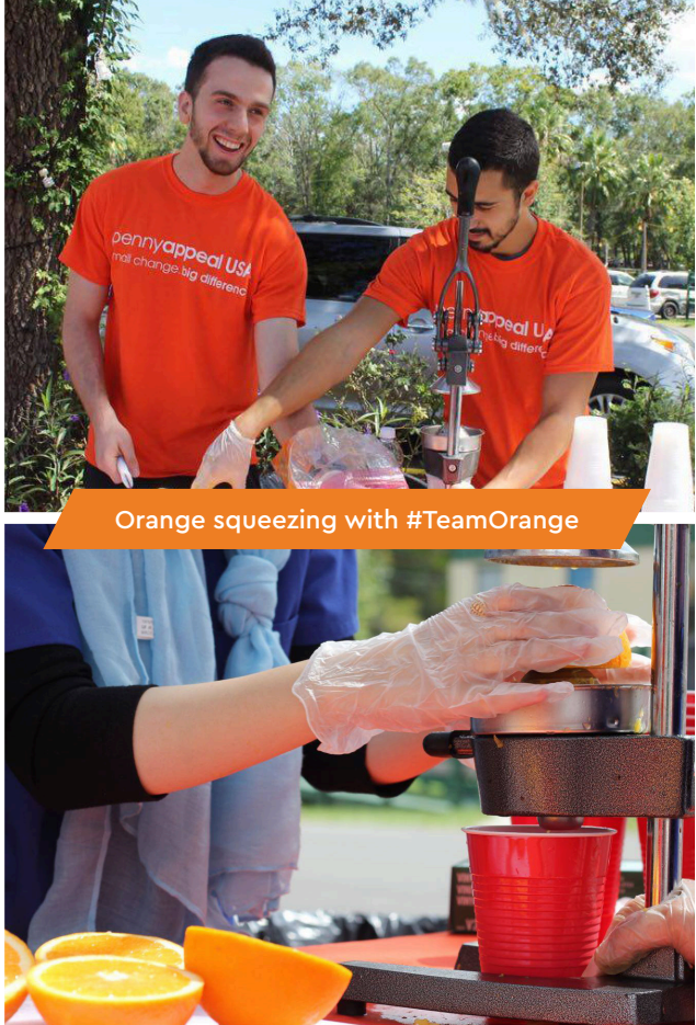
Orange squeezing with #TeamOrange

Downtown Islamic Center, located in Chicago, provides homeless shelters with meals every Sunday, and #TeamOrange provided hygiene kits with substantial items, including masks, hand sanitizer, body wipes, and more for them to distribute in collaboration. #TeamOrange distributed 100 hygiene kits with essential items, including masks, deodorant, toothpaste, and more to the Weinberg House located in Baltimore.