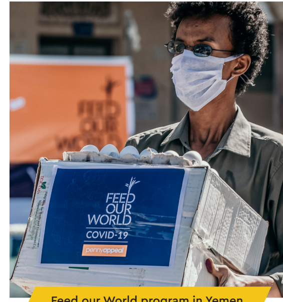
Feed our World program in Yemen