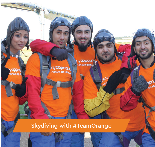
Skydiving with #TeamOrange