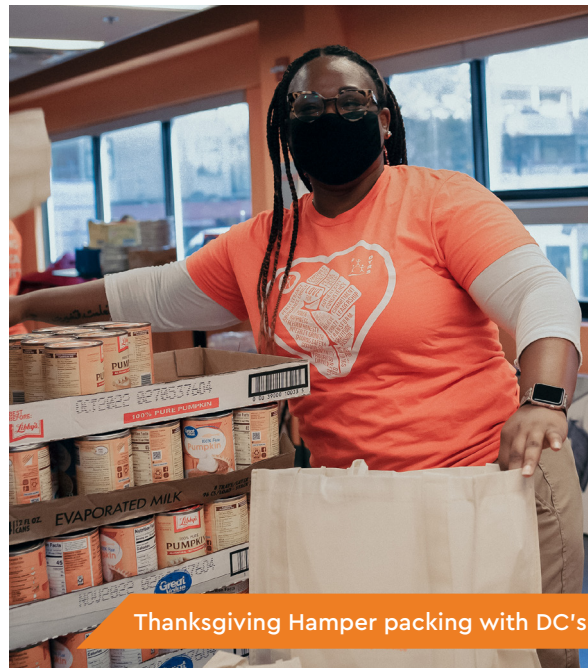
Thanksgiving Hamper packing with DC's Department of Youth Rehabilitation Services