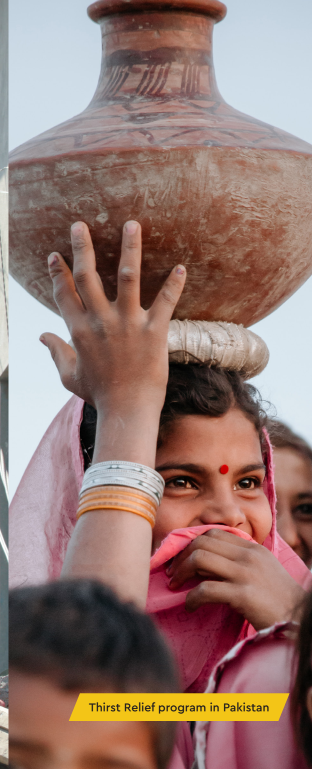
Thirst Relief program in Pakistan