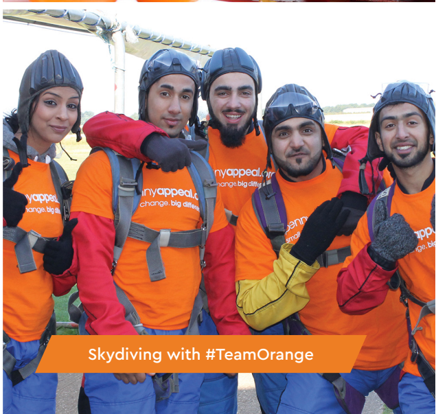
Skydiving with #TeamOrange