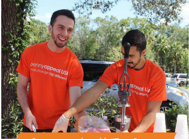
Orange squeezing with #TeamOrange

Downtown Islamic Center, located in Chicago, provides homeless shelters with meals every Sunday, and #TeamOrange provided hygiene kits with substantial items, including masks, hand sanitizer, body wipes, and more for them to distribute in collaboration. #TeamOrange distributed 100 hygiene kits with essential items, including masks, deodorant, toothpaste, and more to the Weinberg House located in Baltimore.