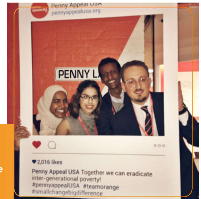
First Penny Appeal Staff at 2016 Office Launch Party

As passionate, young professionals coming from a range of humanitarian nonprofits, we were all frustrated with the starvation cycle that cripples too many nonprofit organizations and forces them to spend less money on their foundation, and therefore limit the potential of their impact.