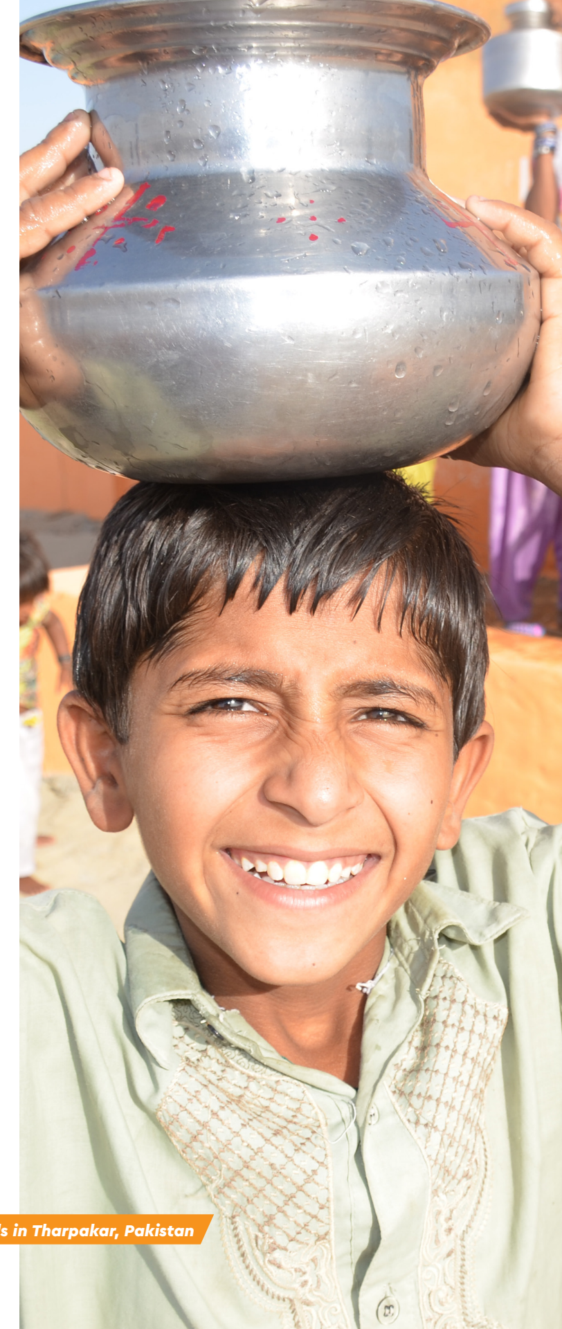
Solar Water Wells in Tharpakar, Pakistan

Bangladesh has made little progress thus far in continuing to improve water, sanitation, and hygiene (WASH) conditions. About 13% of the population still lacks access to safe water sources and sanitation, and only 61% have access to safe sanitation. However, further development is at a stand still. Continuous effort is required to maintain progress. The vulnerability of Bangladesh to natural disasters further hinders progress towards achieving WASH standards. Its coastal position means that developments are susceptible to seasonal floods, storms, and tidal surges. As a result, WASH structures are often washed away, damaged, or even demolished. This leaves communities back at square one, forcing them to use unsafe water and resort back to unsanitary hygiene practices.