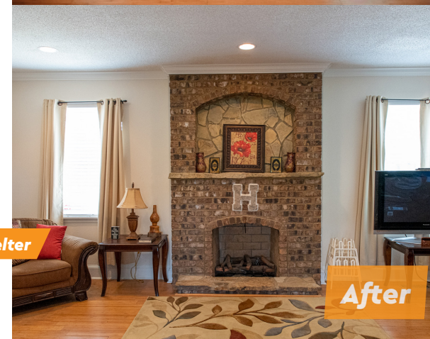
Inside of the NC Domestic Violence Shelter