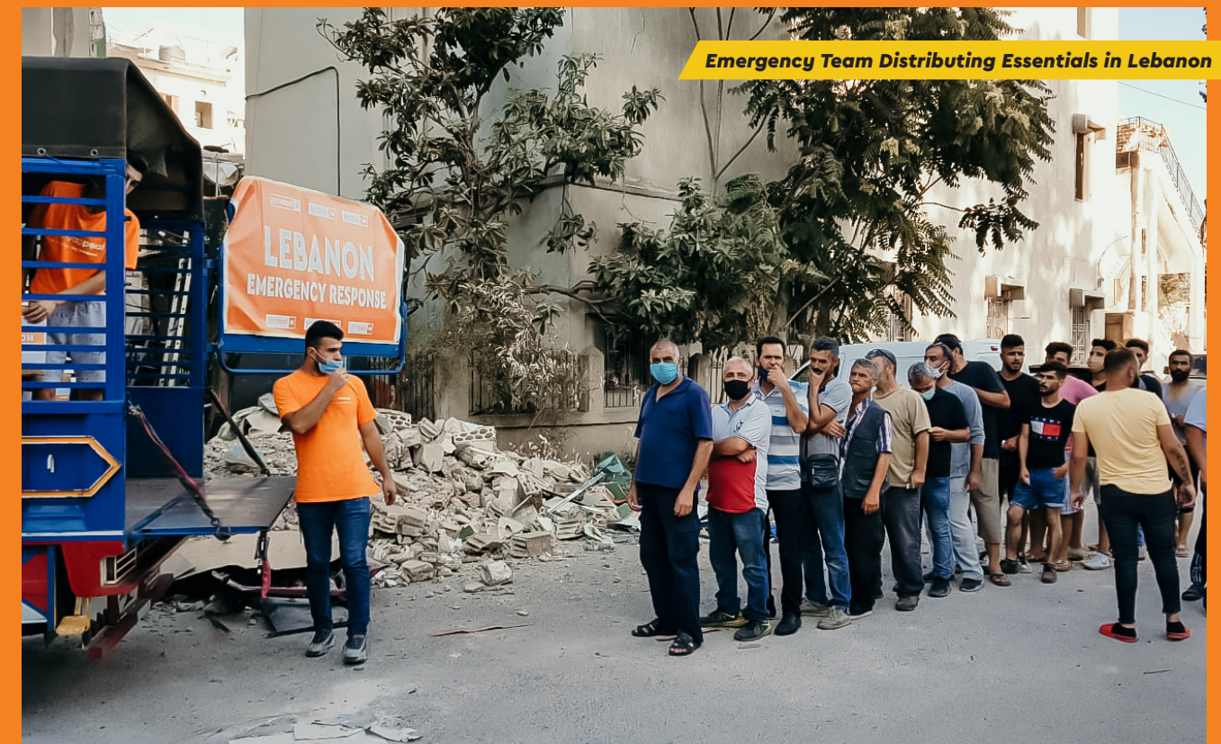
Emergency Team Distributing Essentials in Lebanon

Greece hosts about 100,000 refugees. This number is increasing on a daily basis. The number of refugees in Greece has risen by more than 200%, mainly due to conditions in Syria and the Turkish government's efforts to relocate refugees away from Istanbul. Just 10% of those in Greece have jobs. Refugees receive no orientation or training support from the state.