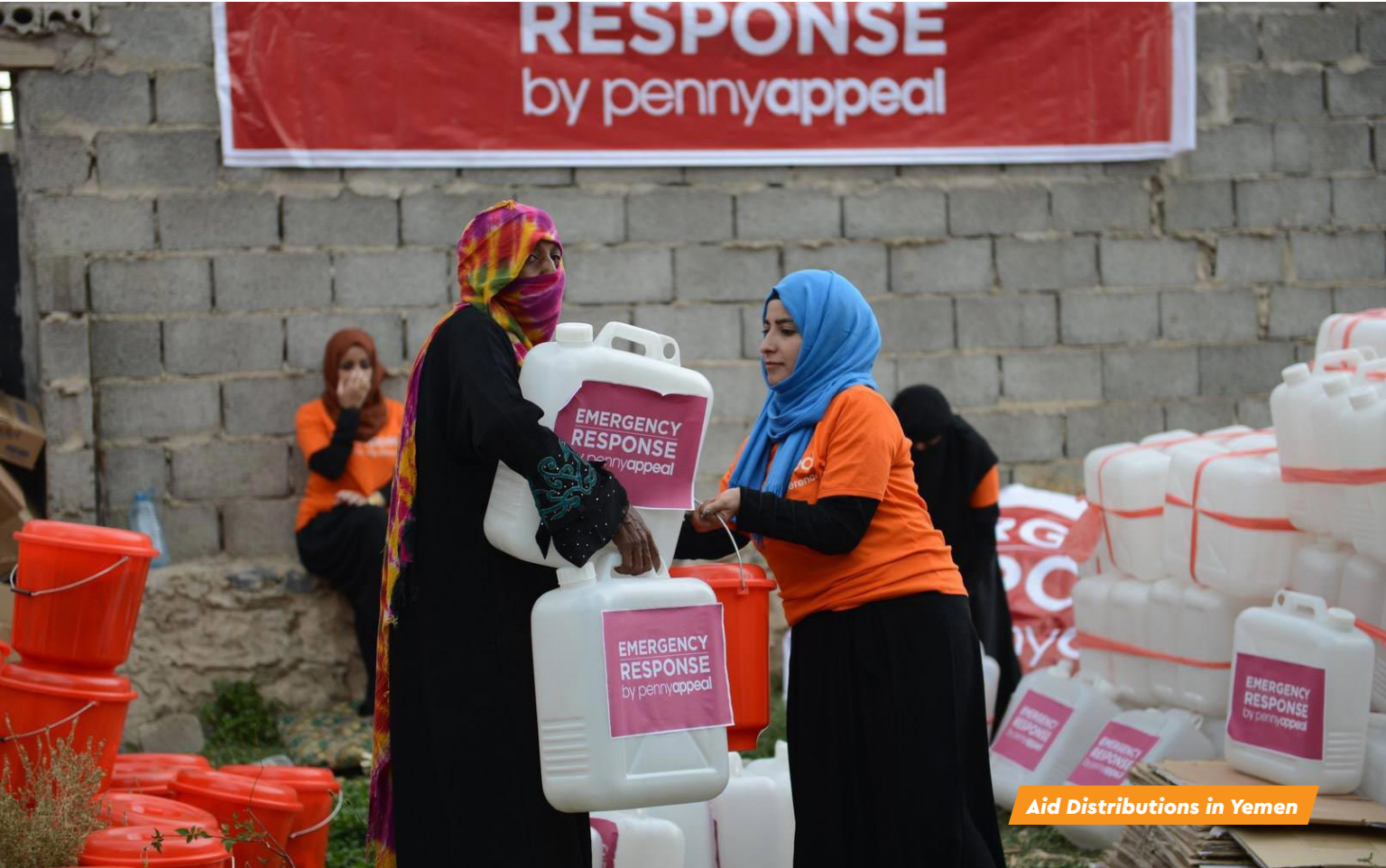
Aid Distributions in Yemen

The construction of Mera Apna Ghar (My Own Home), an OrphanKind complex has been halted and delayed due to COVID-19. Once the complex is built, it will help transform the lives of orphaned children for a better future.