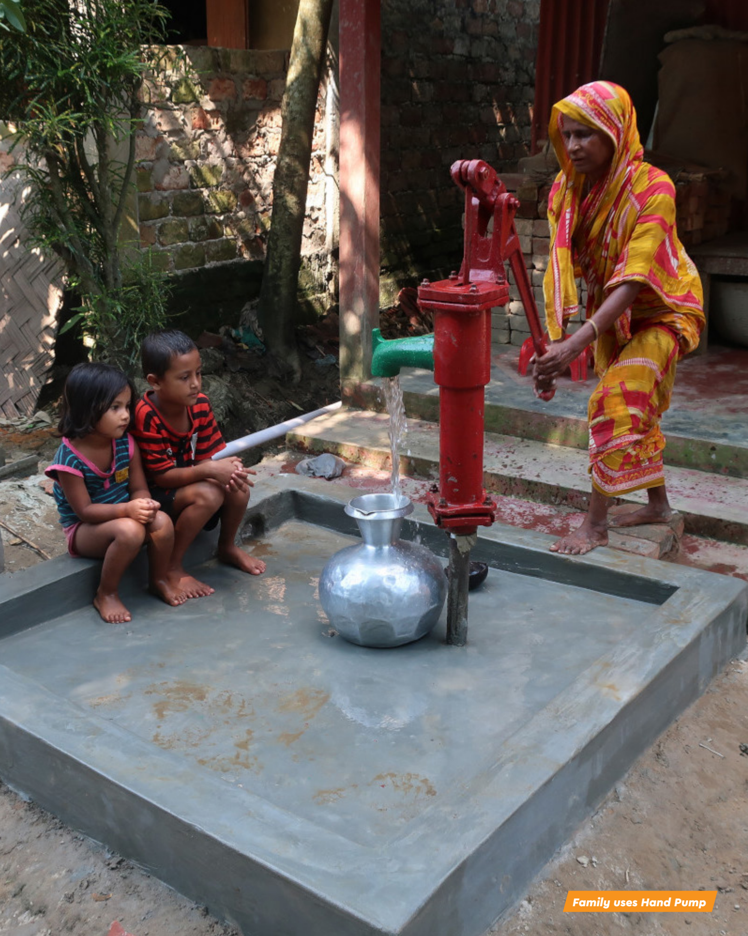
Family uses Hand Pump