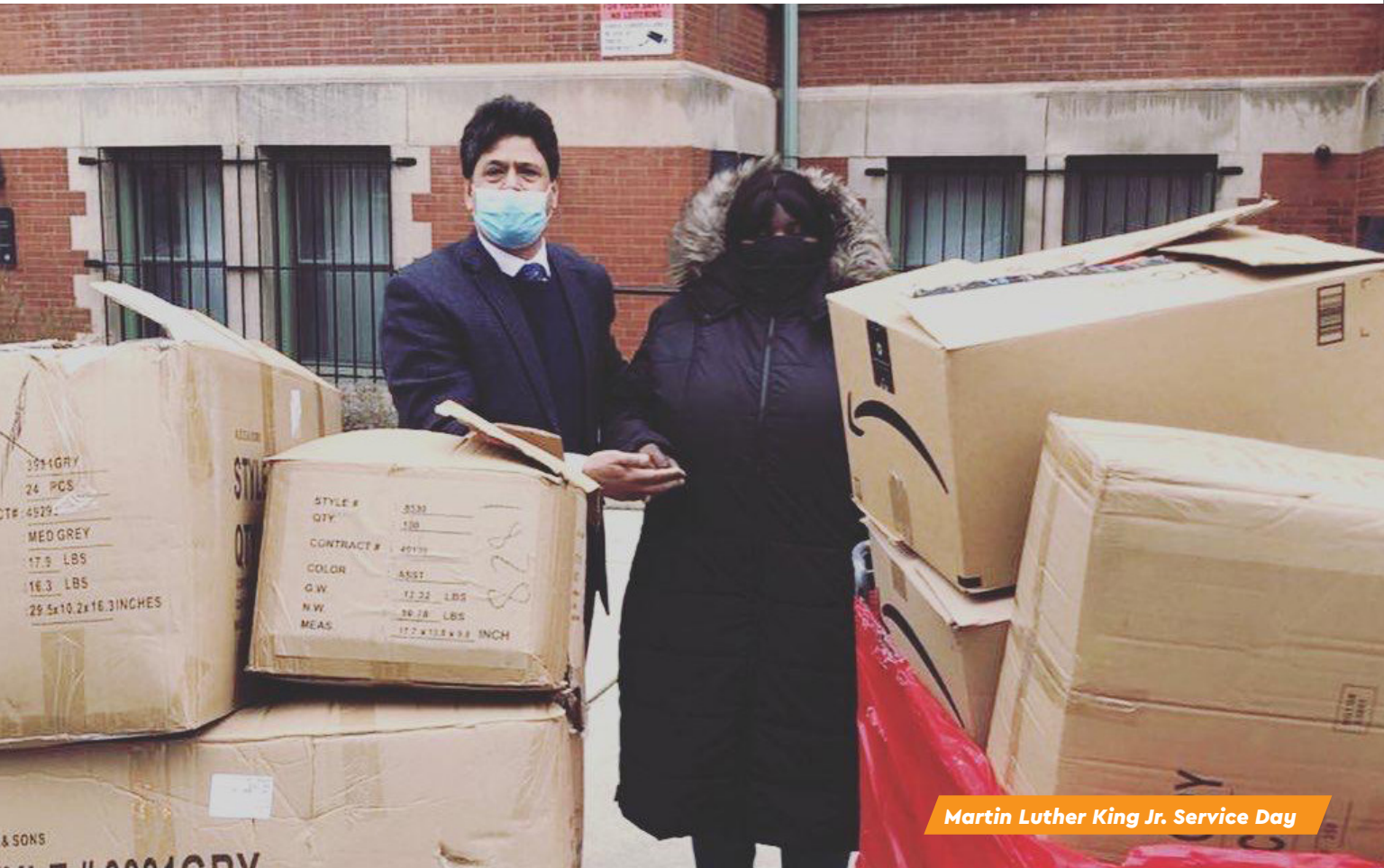
Martin Luther King Jr. Service Day

In October 2019, following years of broken public policies, Lebanon entered an unprecedented economic collapse. Their economic problems have been building for years, resulting in protests and igniting a political crisis. When COVID-19 struck just a few months later, families who were already vulnerable sank even further into need. The explosion at the Beirut port was the last straw for Lebanese communities in crisis. Additionally, the country is home to half a million Syrian refugees. With more than 70% of refugees in Lebanon living under the poverty line in overcrowded conditions, social distancing is virtually impossible.