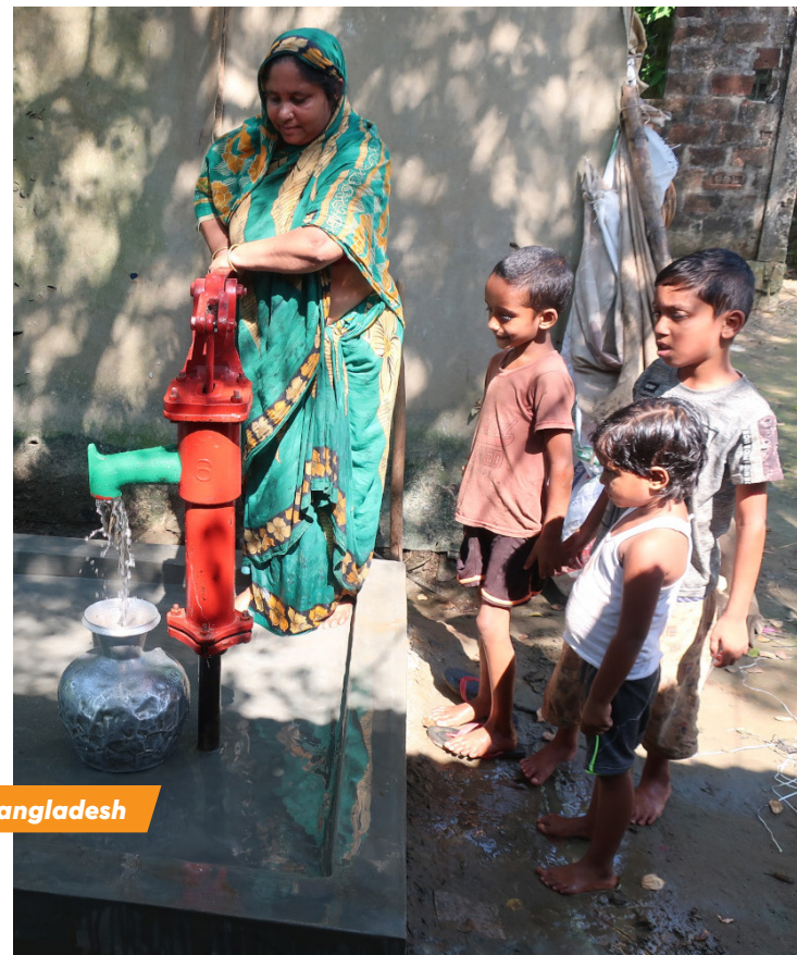
Hand Pump in Bangladesh

According to the World Health Organization, 1 in 3 people globally do not have access to safe drinking water-about 2.2 billion people worldwide. Drinking contaminated water can cause diseases like cholera, diarrhea, hepatitis A, and polio. Over 825,000 people are estimated to die each year from diarrhea as a result of unsafe drinking-water, sanitation, and hygiene.