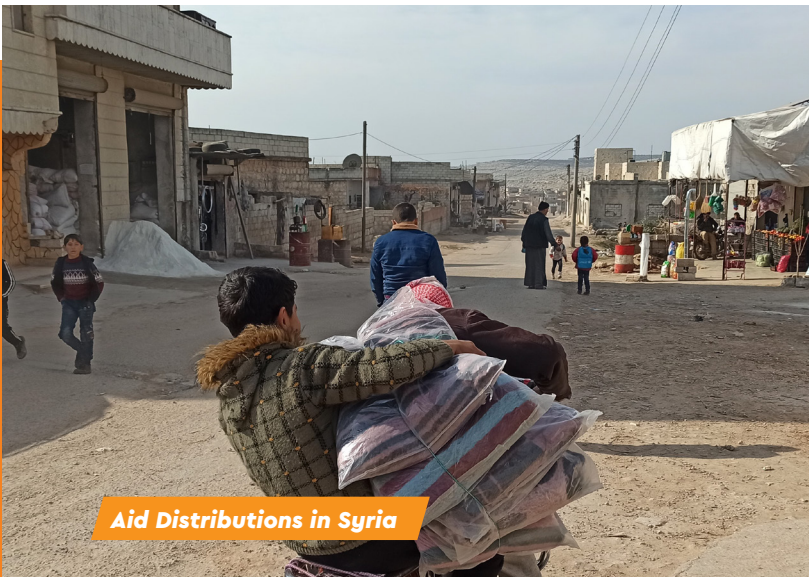
Aid Distributions in Syria

Why We're Doing It Climate change, frequent disasters, and the COVID-19 pandemic have posed serious threats to Pakistanis living in the most remote areas. The valley of Swat in the north of Khyber Pakhtunkhwa province is enclosed by mountains. In the winter season, heavy snowfall often forms into glaciers, which have previously become an obstacle for transportation. Sometimes, snow is 5-10 feet deep, confining residents to their homes. While most people migrate in the winter season, underserved communities have no choice but to stay and fight the harsh winter cold. They have no alternative shelter options, lack of access to warm clothing, and no resources to purchase items necessary for coping with harsh weather conditions.