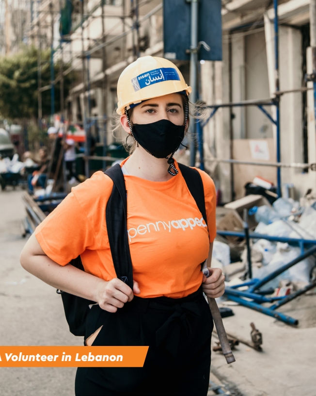
PA Volunteer in Lebanon

Why We're Doing It Families are facing an economic collapse that has only been worsened by the explosion that took place on August 4, 2020. Layered with an ongoing global health crisis, this winter could be the most difficult that Lebanese communities have ever had to endure.