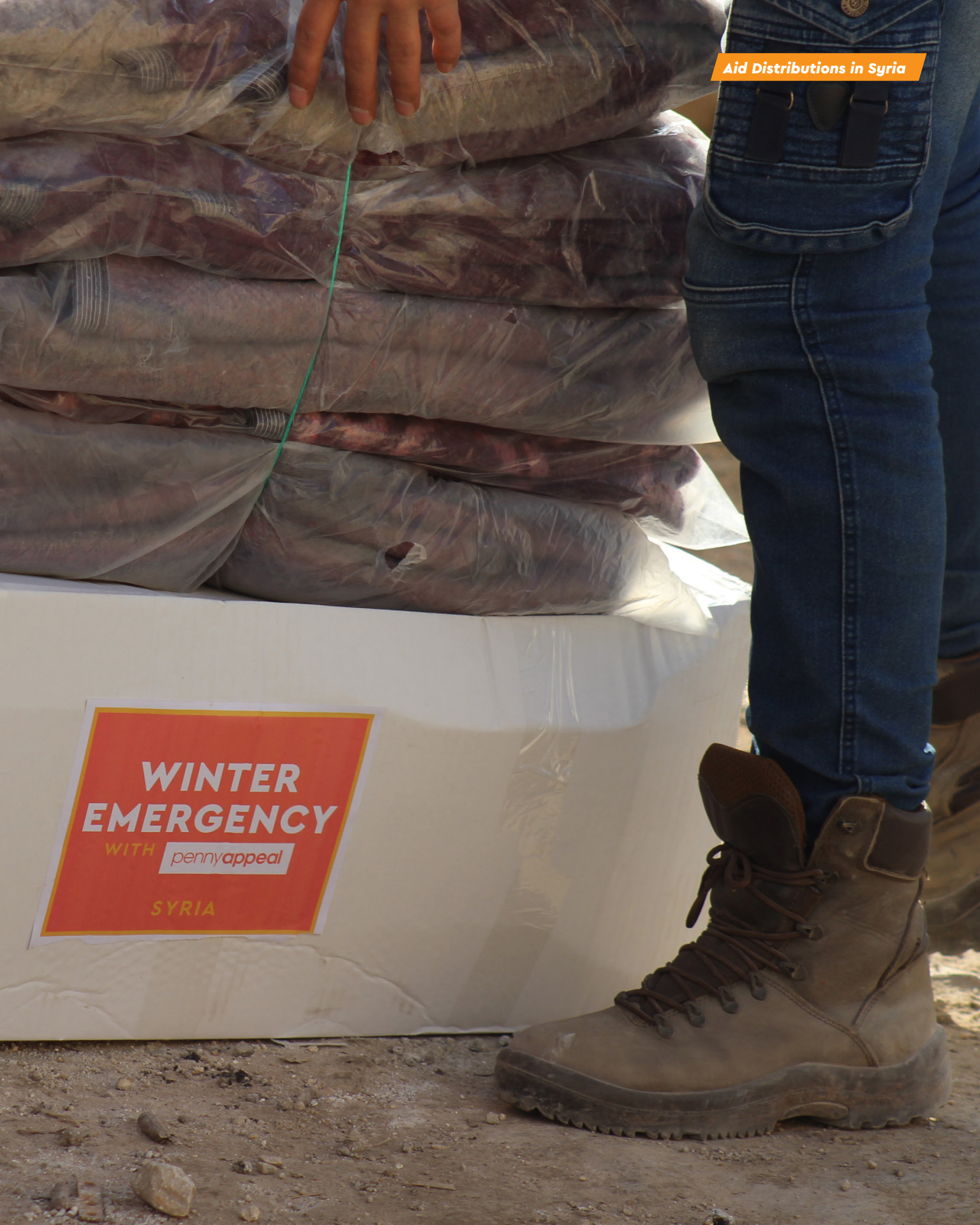
Aid Distributions in Syria