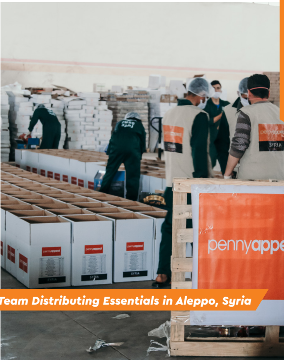
Emergency Team Distributing Essentials in Aleppo, Syria

Why We're Doing It Over 11 million people are still in need of humanitarian assistance according to the 2020 Syria Humanitarian Needs Overview (HNO). During the brutal winter months, citizens in North-West Syria require immediate aid to protect them against the bitterly cold conditions, which regularly reach below 32 degrees. According to the UNHCR, an estimated 1.4 million people are in need of substantial assistance in preparation for the winter.