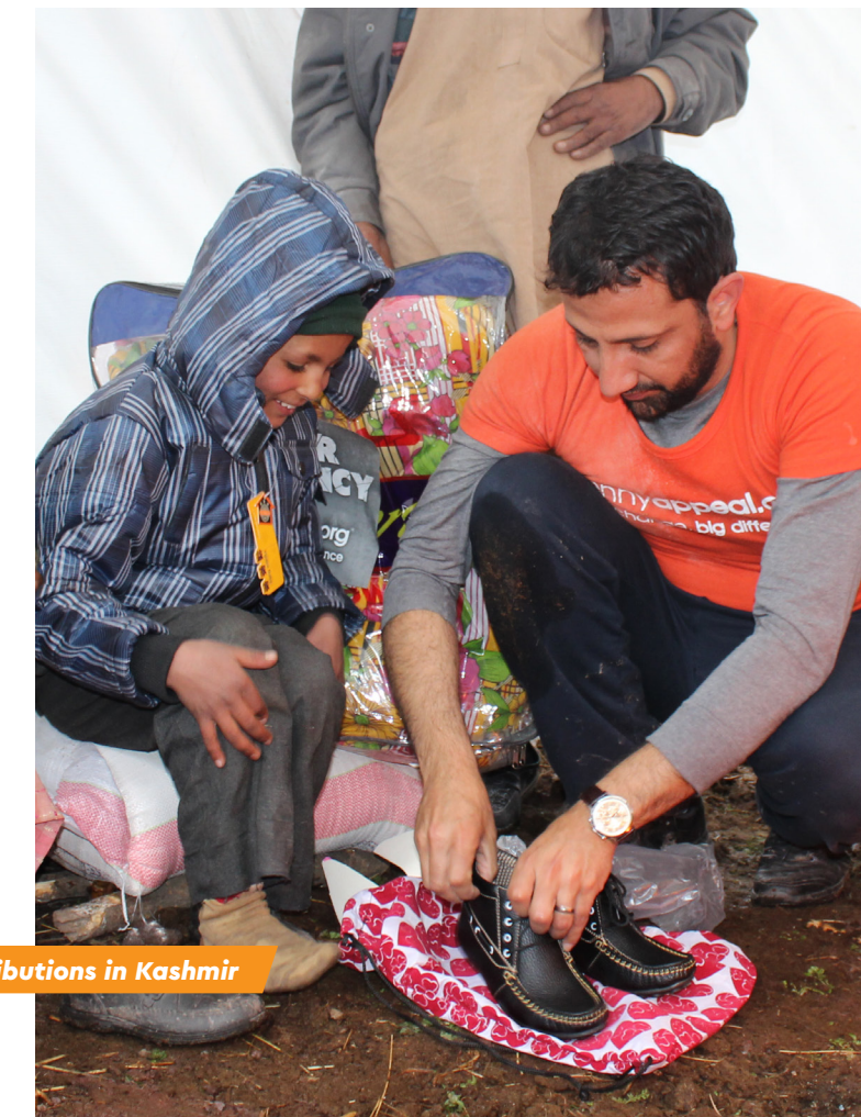
Aid Distributions in Kashmir

As Yemen continues to face a humanitarian crisis with civil war and famine, coupled with COVID-19, winter brings even more challenges as those who struggled to find food, clean water, and shelter will also fight to get warm.