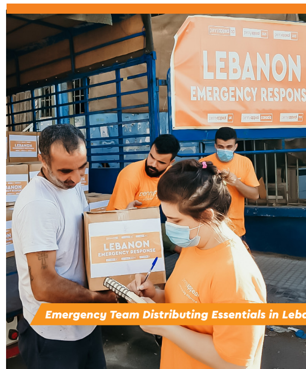
Emergency Team Distributing Essentials in Lebanon

+50 Homes +200 Individuals +32 Families +2,190 Food Packs