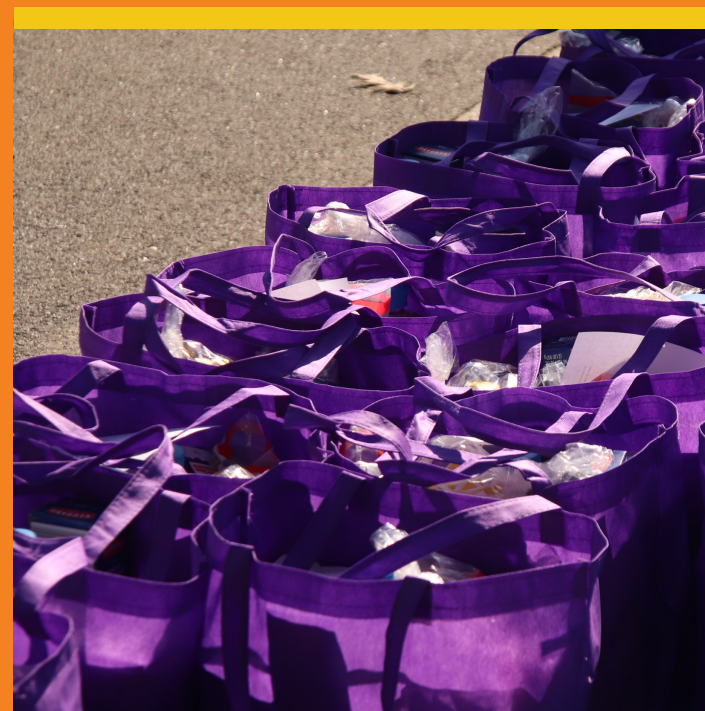
Fidyah Donation Distribution