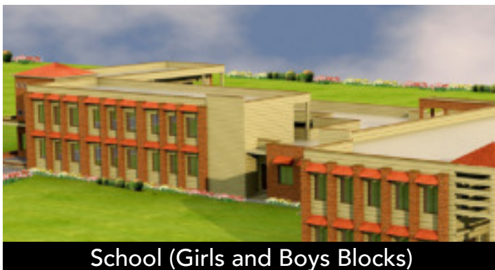
School (Girls and Boys Blocks)